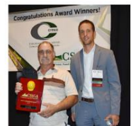
2017 Safety Award Winners