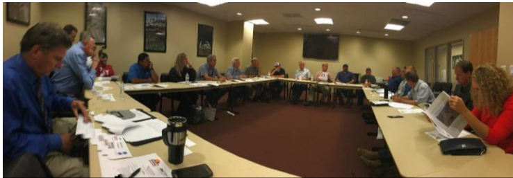
August 2017 MSHA Regulatory Roundtable